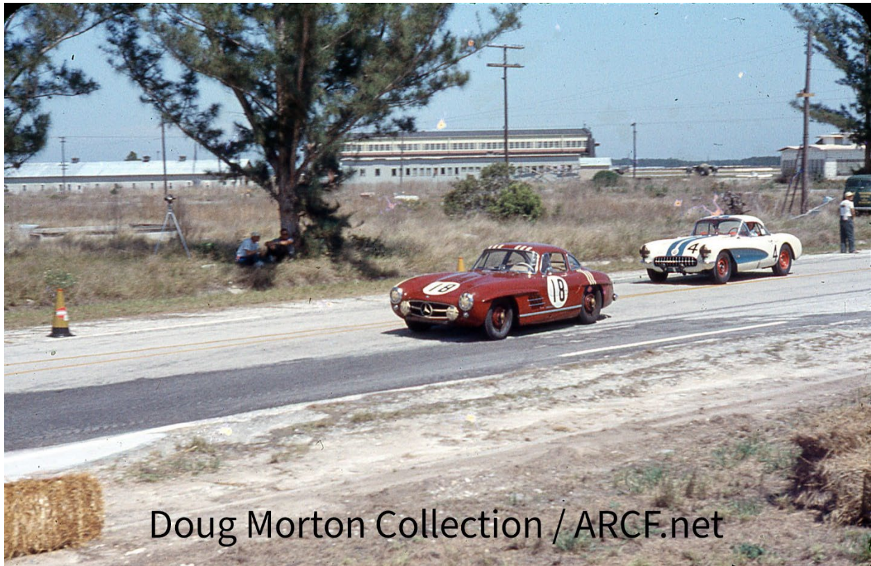
The #18 Mercedes Gullwing, along with the #4 Vette, making their way through the Esses.