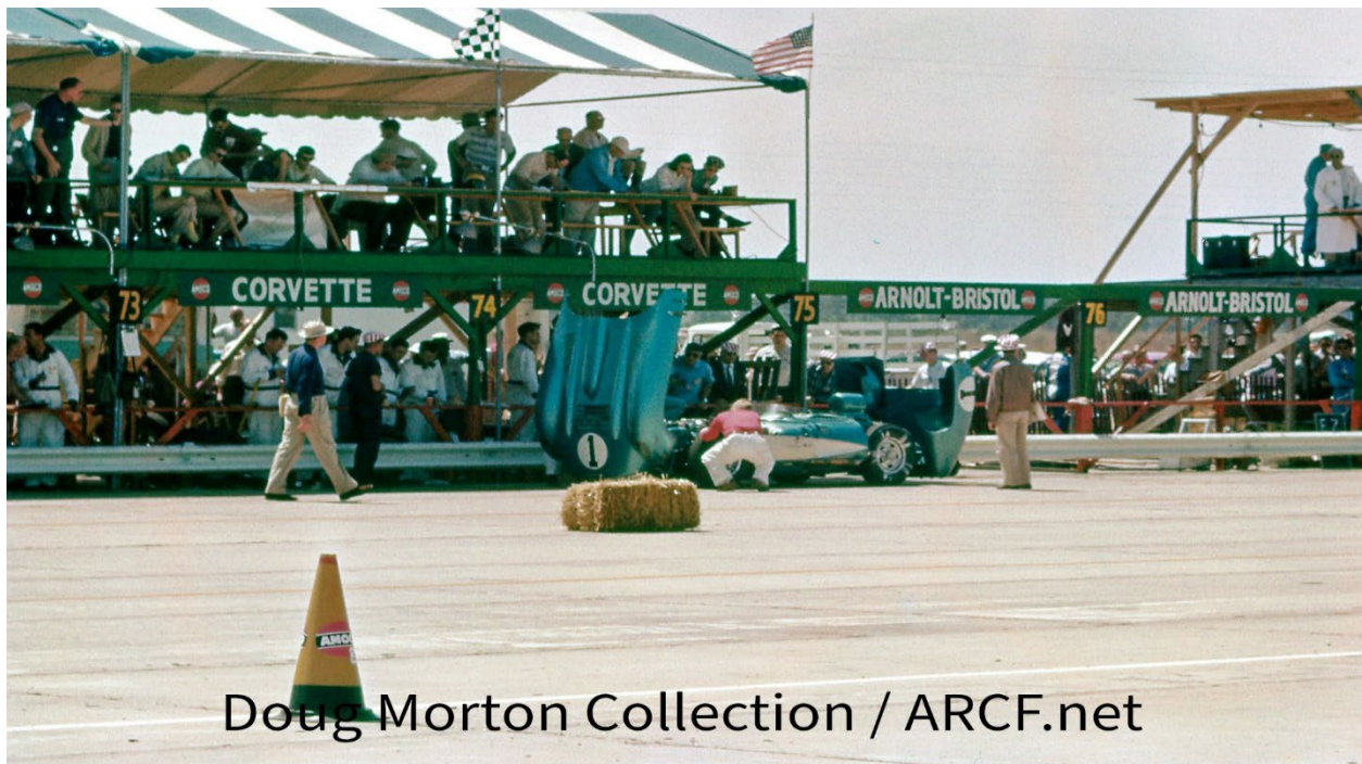
The Corvette SS in the pits early on in the race. Problems with the brakes and ignition would cause its retirement after 23 laps.