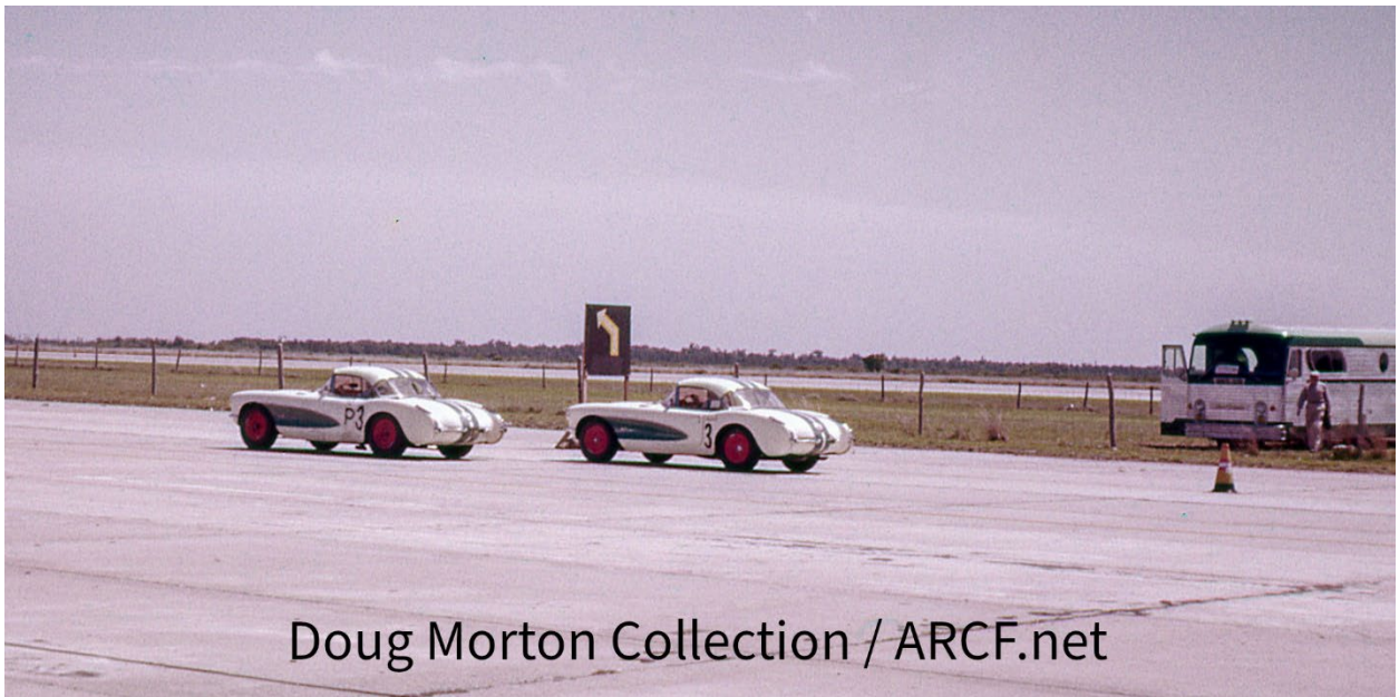
The SS heading around the Big Bend on its way to the Hairpin.