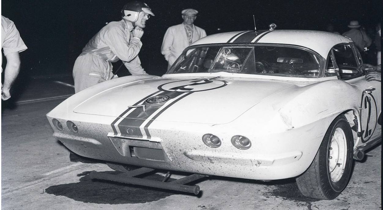
Driver change at night for the #2.