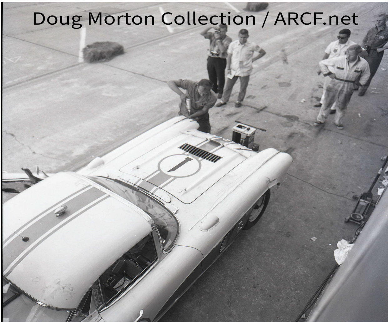
Making repairs during the race in the pits. They had to strap on some headlights so they could race at night.